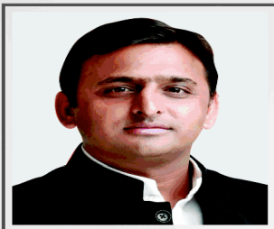
Shri Akhilesh Yadav Hon'ble Chief Minister, Uttar Pradesh